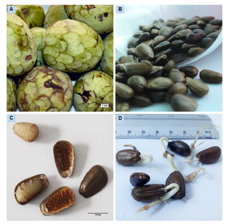
Figure 1 - Cherimoya ( Annona cherimola ): A – Fruits; B, C – Seeds; D - Seed germination and seedling emergence after 25-day period

The lengths of eight randomly selected seedlings (SL) per thermal condition were also recorded at the end of the experimental period using a digital caliper.